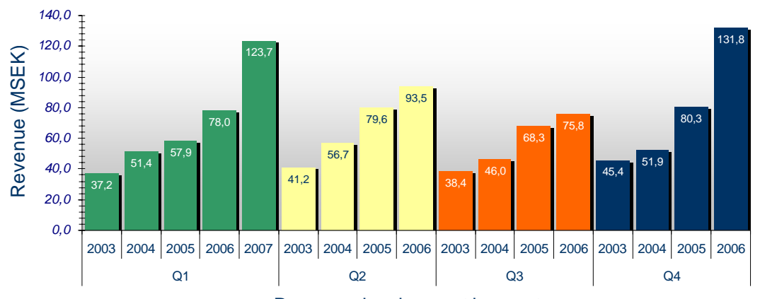
Revenue development by quarter

BTS' turnover excluding acquisitions of APG and RLC and adjusted for changes in exchange rates increased by 10 percent.